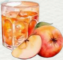
Crisp Apple Bliss